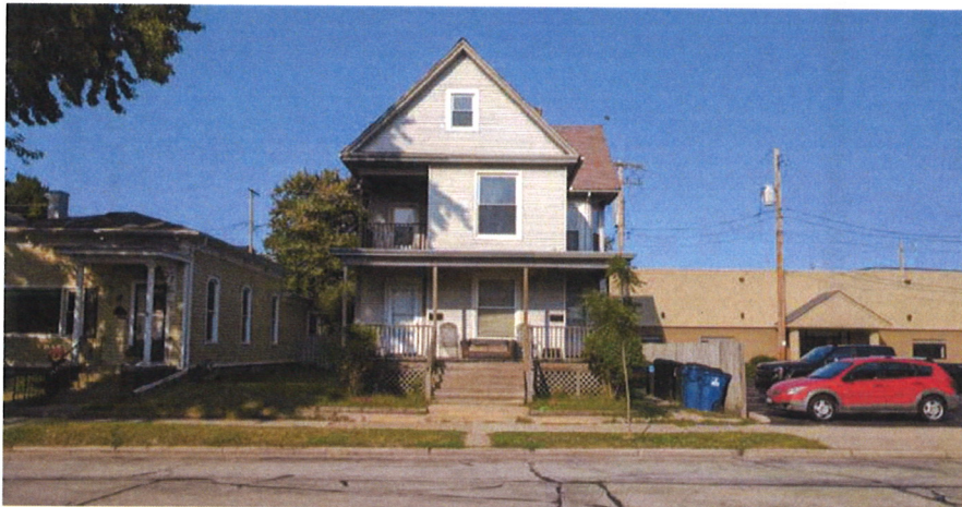
718 Grand Avenue - Adjacent Building South