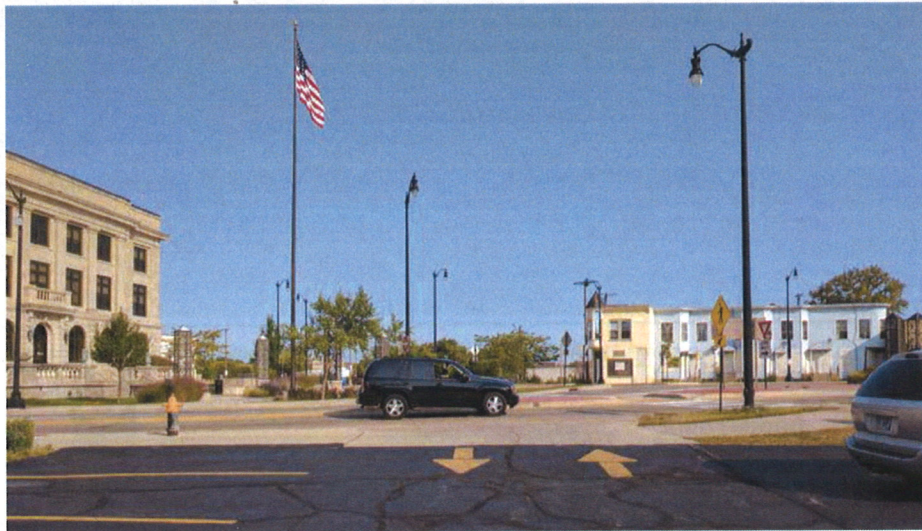
719 Washington Ave - View Across the Street

FASTSIGNS More than fast. More than signs. ® 1122 South Airline Rd, Ste 103 Mount Pleasant, WI 53406 262-977-7900