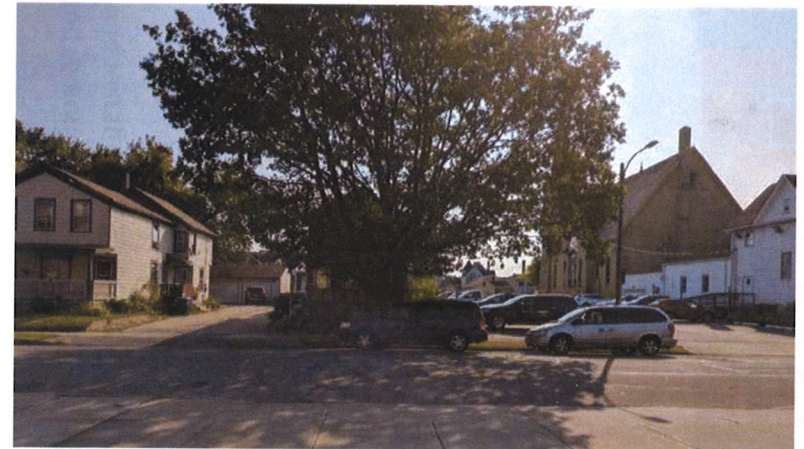
718 Grand Avenue - View Across the Street

FASTSIGNS More than fast. More than signs. ® 1122 South Airline Rd, Ste 103 Mount Pleasant, WI 53406 262-977-7900