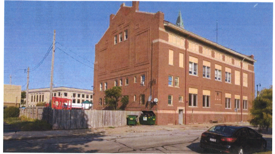
718 Grand Avenue - Adjacent Building North