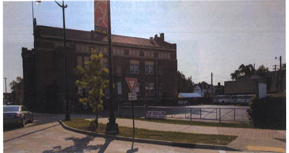
719 Washington Ave - Adjacent Building