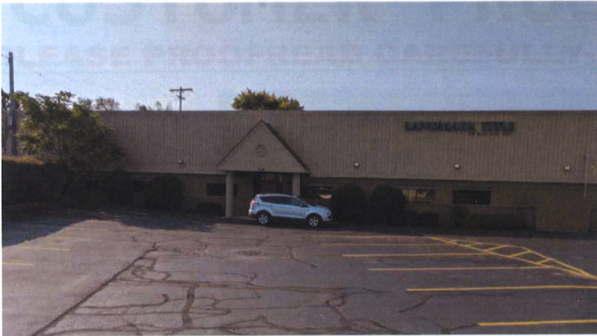
719 Washington Ave - Current View