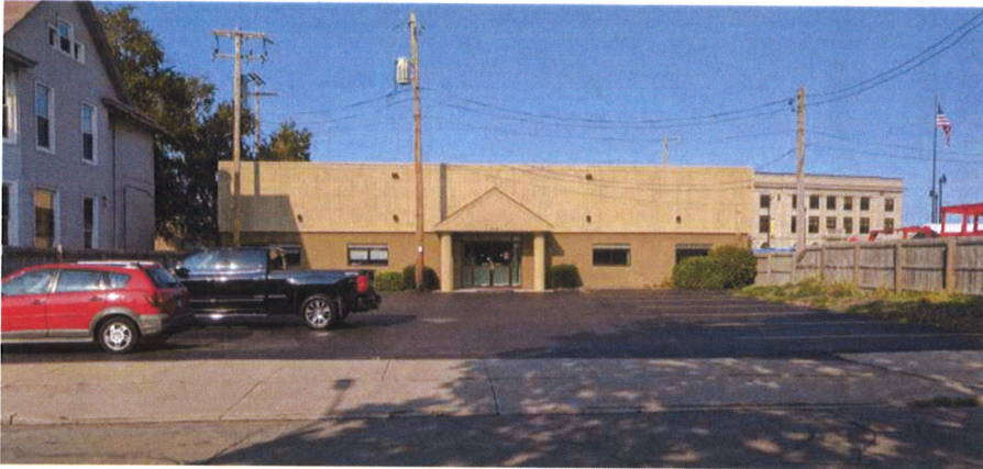
718 Grand Avenue - Current View