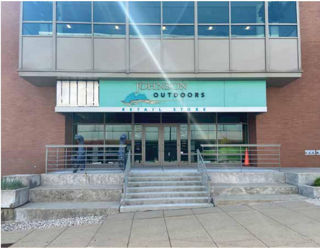
Existing - NTS

[D] - GRAPHICS Graphics: Push-thru [3/4" proud of face] Color: Teal overlay on white acrylic [TBD]