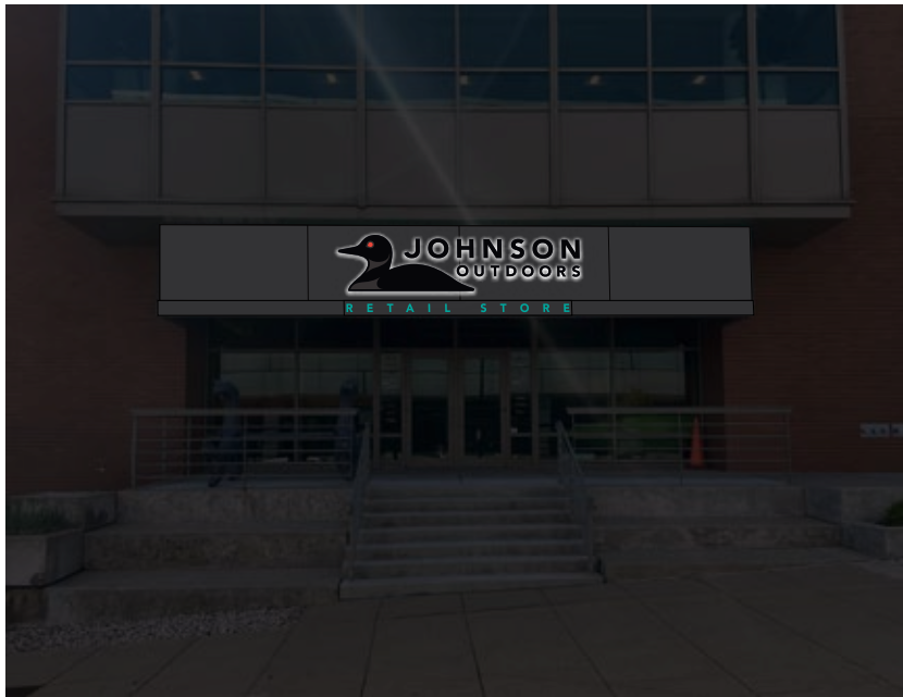
Detail of Night View