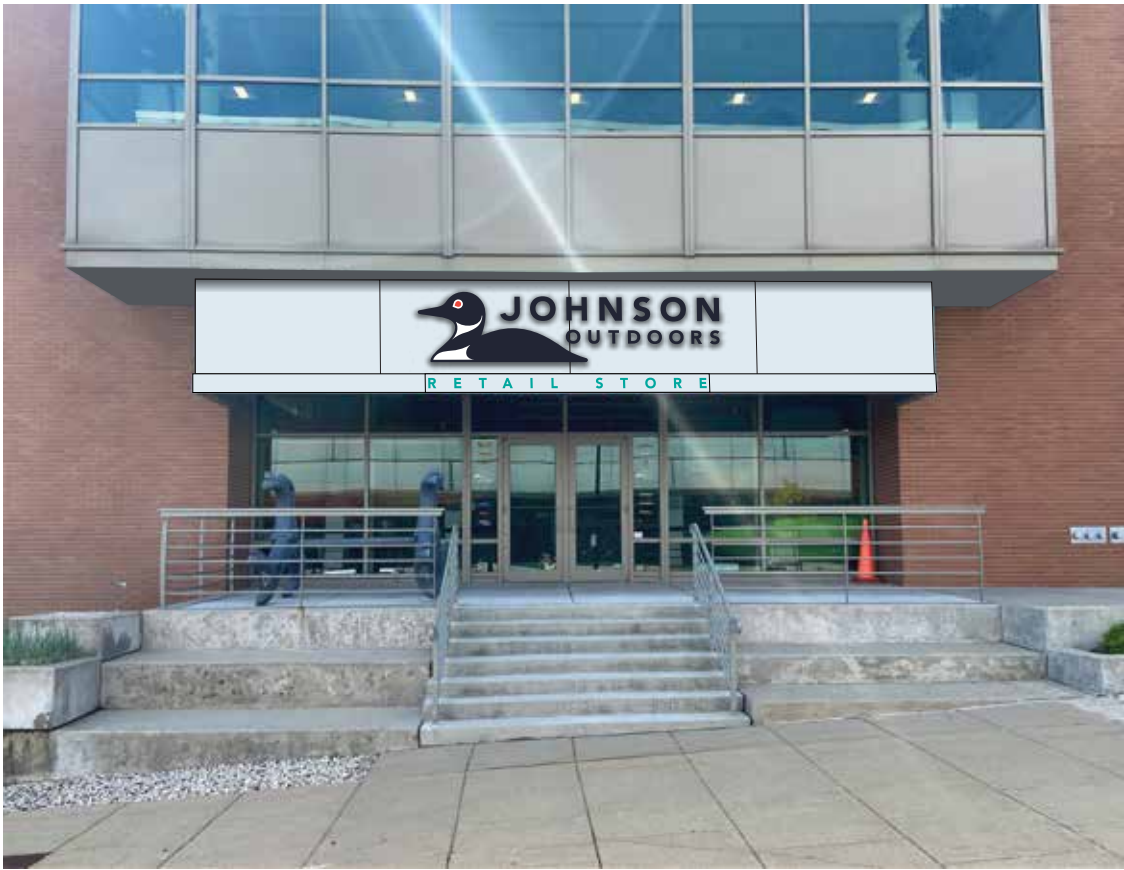
Proposed - NTS