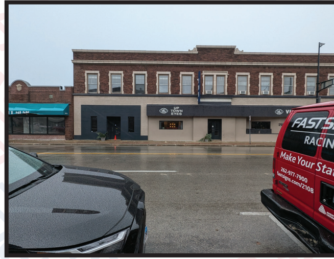
1422 Washington Ave-South