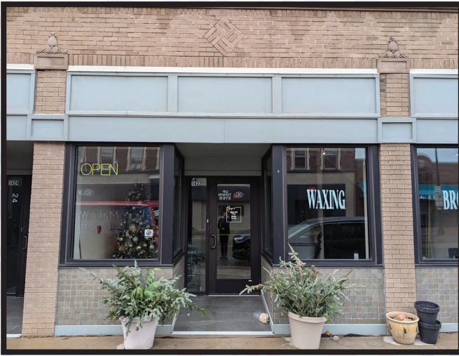
1422 Washington Ave-North