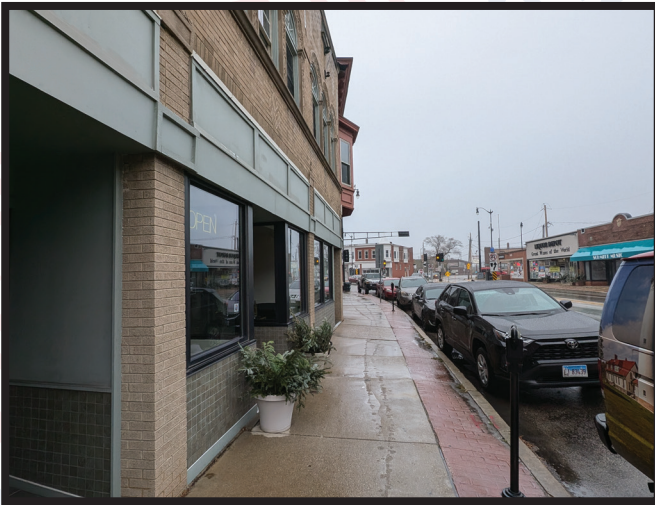
1422 Washington Ave-East