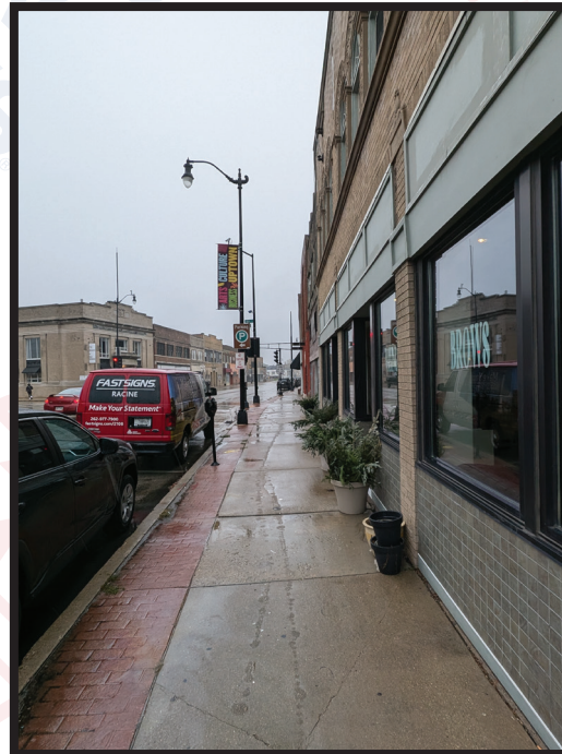
1422 Washington Ave-West