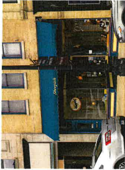
Building to the south