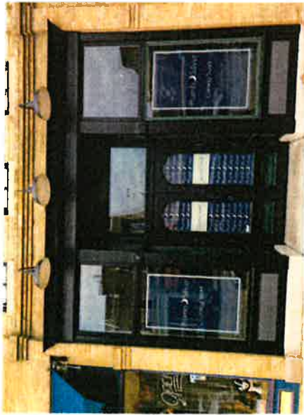
Front of building