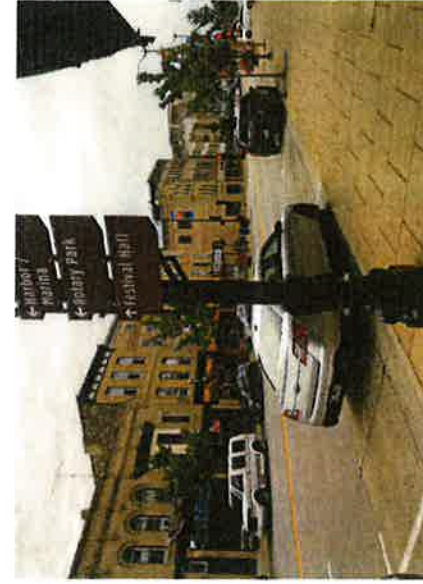
Looking south from Plumb Silver storefront