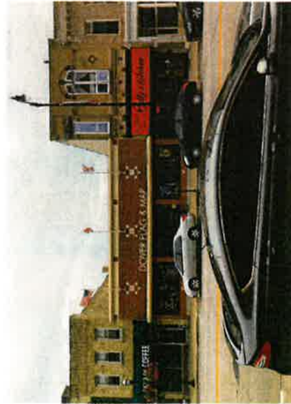
Across the street, looking east