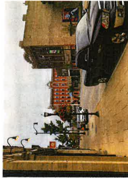
Looking north from Plumb Silver storefront