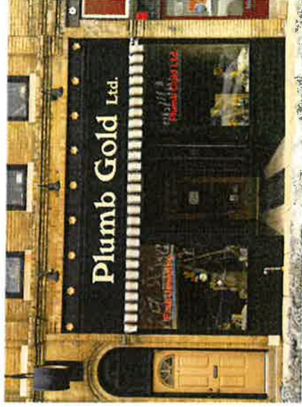
Building to the north