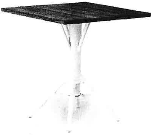
SIDEWALK CAFÉ TABLE