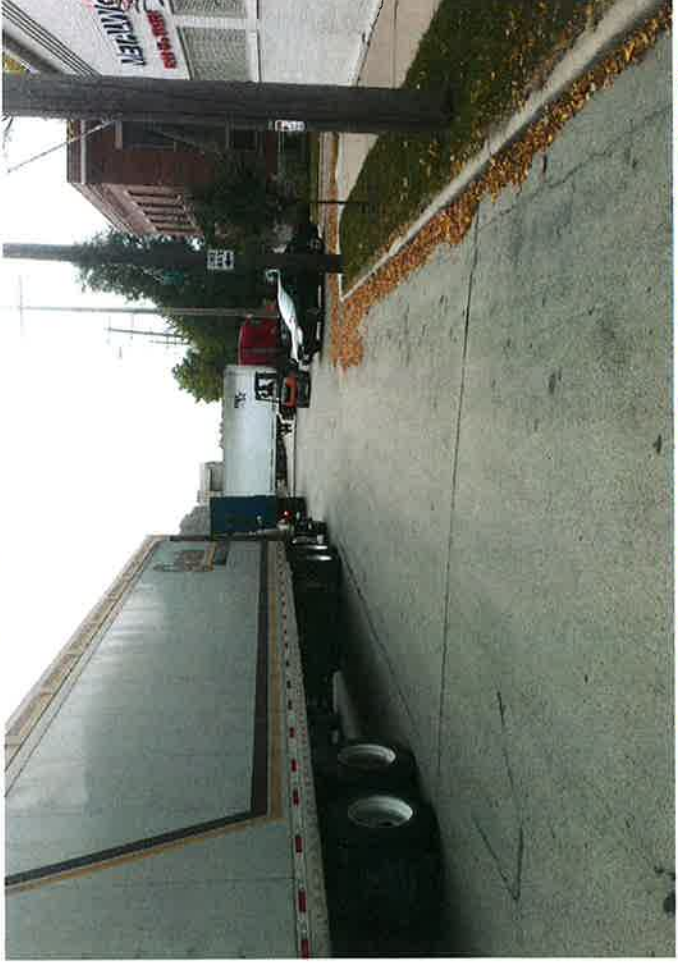
17TH ST @ MURRAY - TRUCK BLOCKING TRAFFIC