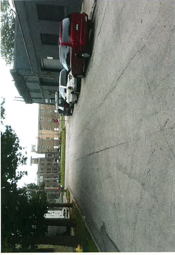
17TH ST. LOOKING EAST