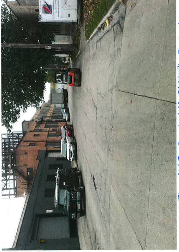
17TH STREET - SOUTH SIDE PARKING - BLOCKING DRIVEWAY BAYS