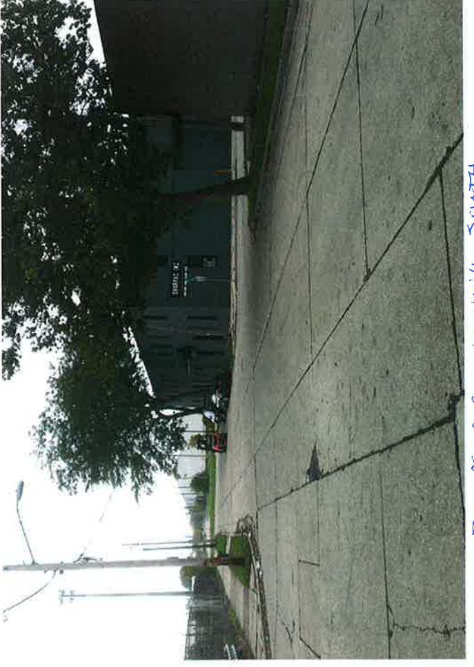
PHILLIPS AVE. LOOKING SOUTH