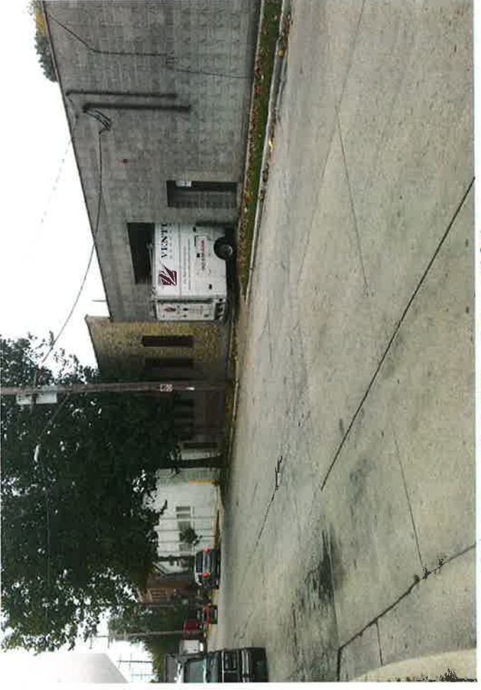
17TH ST. VENTURA DELIVERY