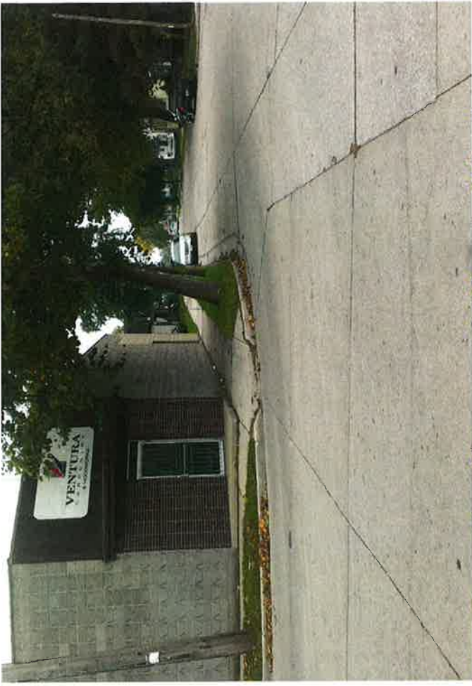
PHILLIPS & 17TH - NW CORNER - NO PARKING