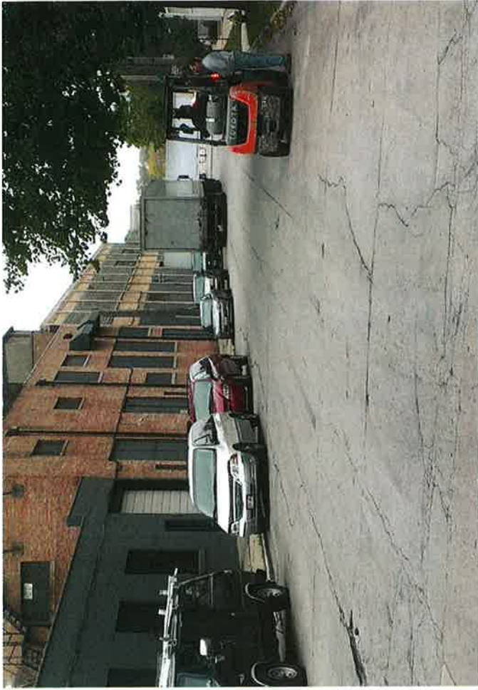
17TH STREET LOOKING WEST.