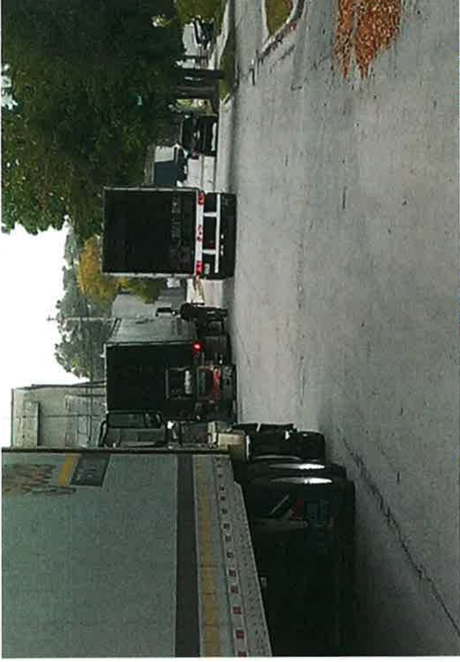
17TH STREET - DELIVERY TRUCKS - STACKED