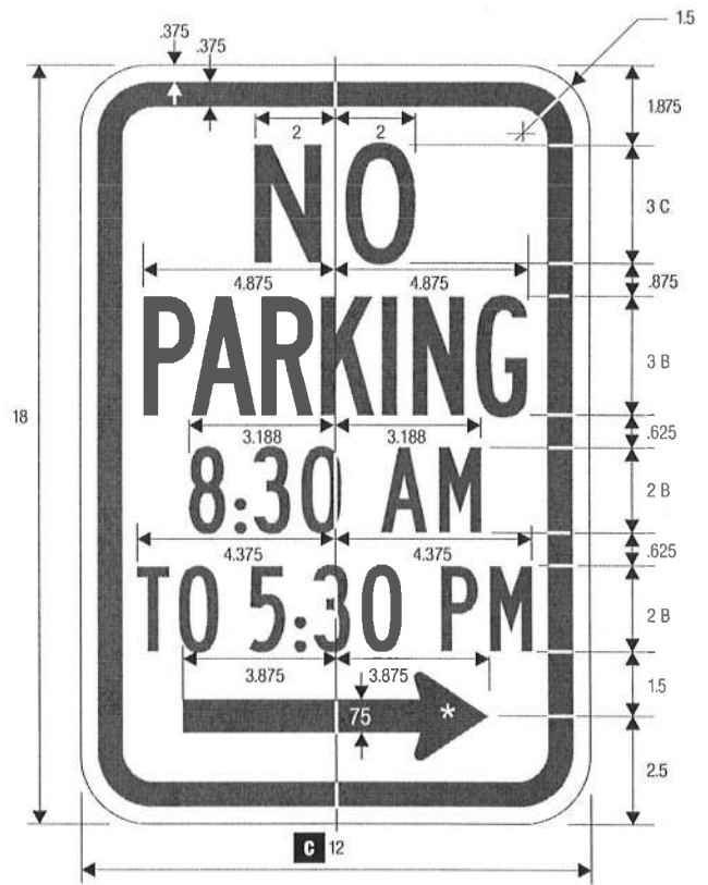
R7-2 NO PARKING

COLORS: LEGEND — RED BACKGROUND — WHITE (RETROREFLECTIVE)