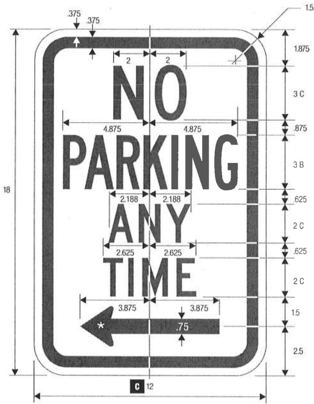
R7-1 NO PARKING