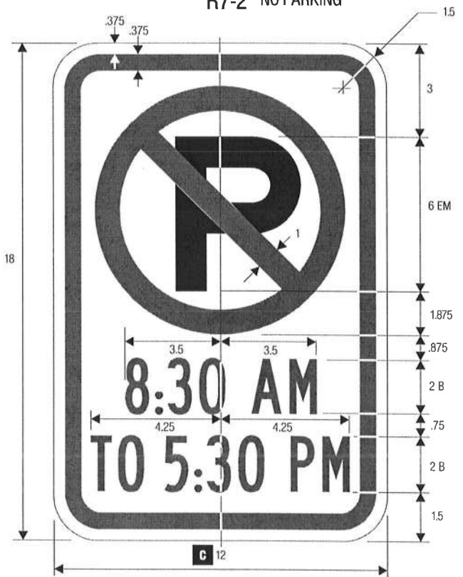
R7-2a NO PARKING

COLORS: LEGEND, CIRCLE & DIAGONAL — RED (RETROREFLECTIVE) BACKGROUND — WHITE (RETROREFLECTIVE) SYMBOL — BLACK