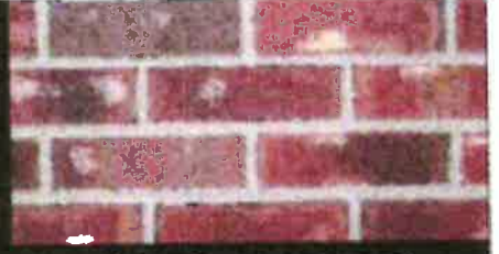
BISCAY STRAIGHT EDGE