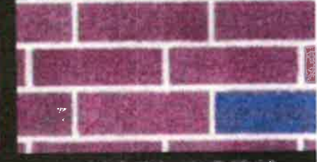
MADRID STRAIGHT EDGE