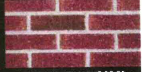
VALENCIA STRAIGHT EDGE