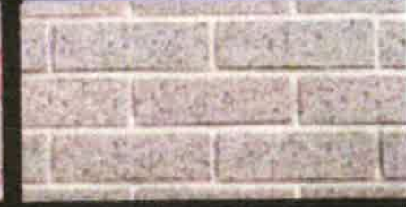
COLONIAL GRAY VELOUR