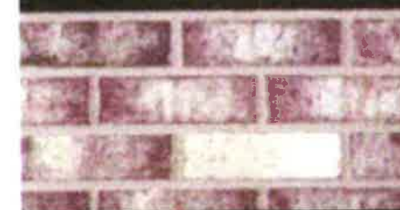
MONACO STRAIGHT EDGE