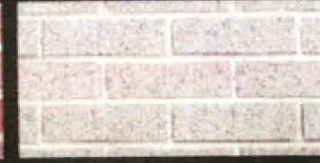
SHADOW GRAY VELOUR