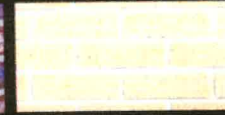
EMPIRE IVORY VELOUR