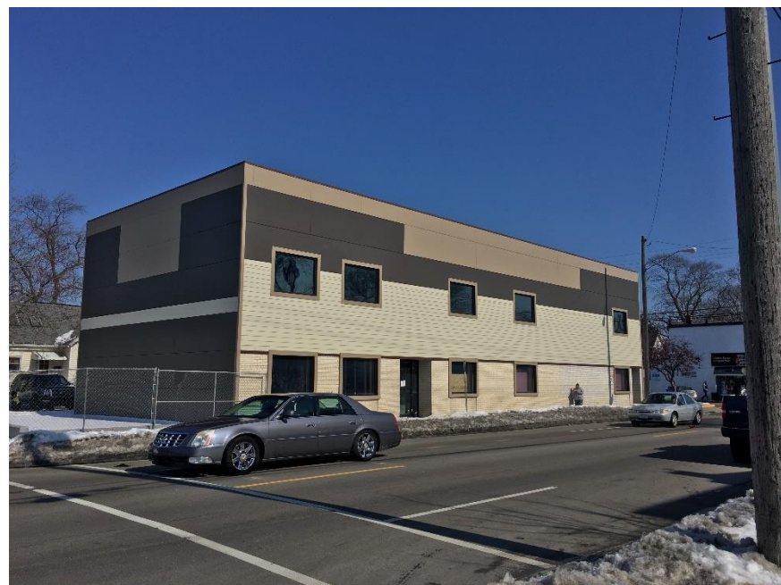
LOOKING NORTHEAST AT FRONT OF BUILDING