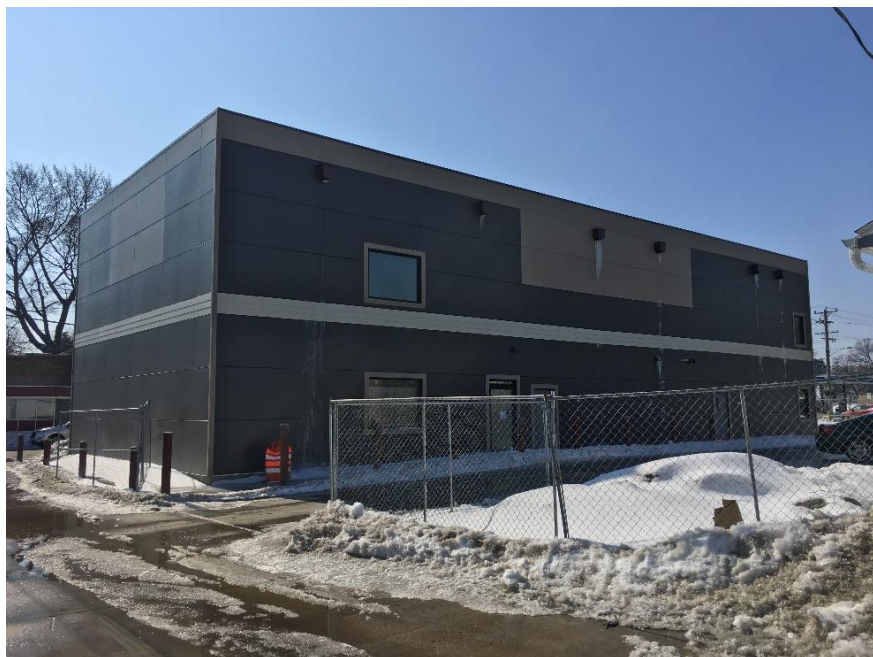
LOOKING SOUTHWEST AT REAR OF BUILDING