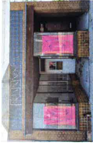
Public View of Sign