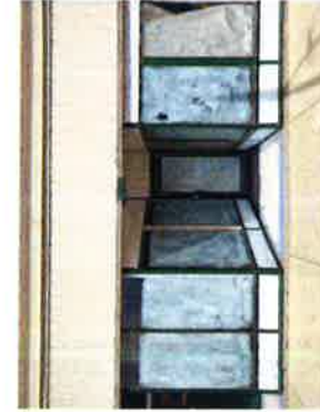
Adjacent Building (West Side)