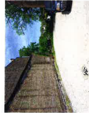
Adjacent Lot (West Side)