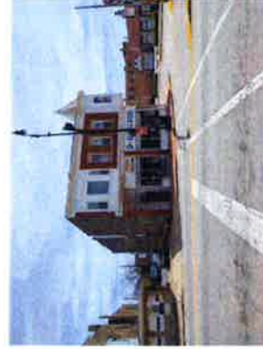
Looking South from 1352 Washington