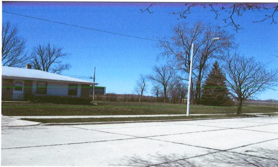
HOUSE ON LEFT IS 2908 JEAN – 2914 & 2920 ARE VACANT

Batten International Airport (Airport) currently owns the lots at 2908, 2914, and 2920 Jean Avenue in the City of Racine. The houses on Lots 2914 and 2920 have been removed for several years. The Airport is in the process of acquiring permits to remove the house at 2908 Jean beginning shortly after July 31, 2010. There will be no houses left on Jean Avenue from 2908 Jean north to the Airport.