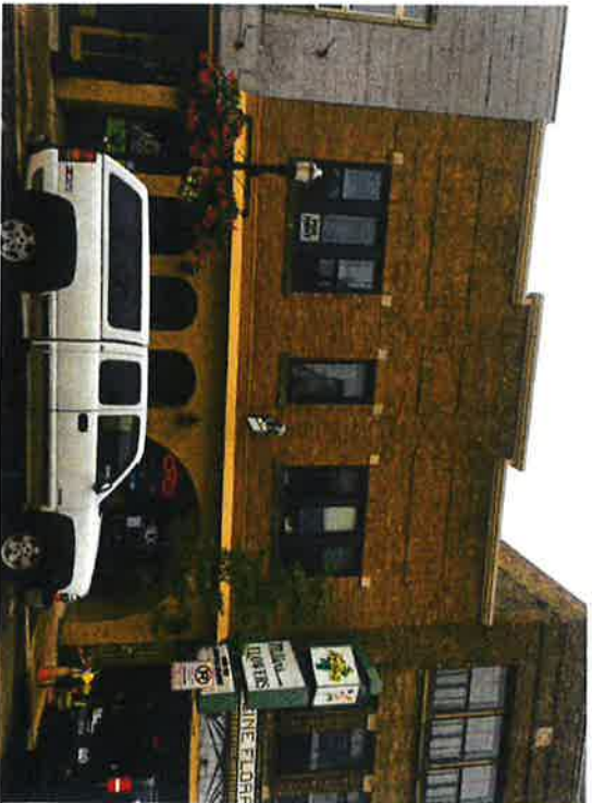
Building across the street south of 216 6 th street