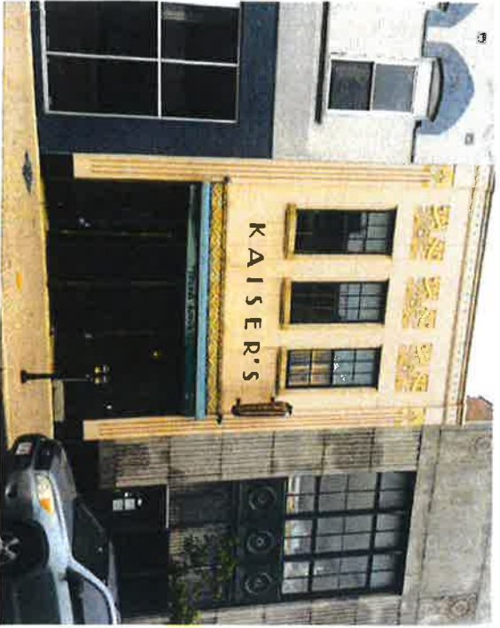
West Building of 216 6 th St.