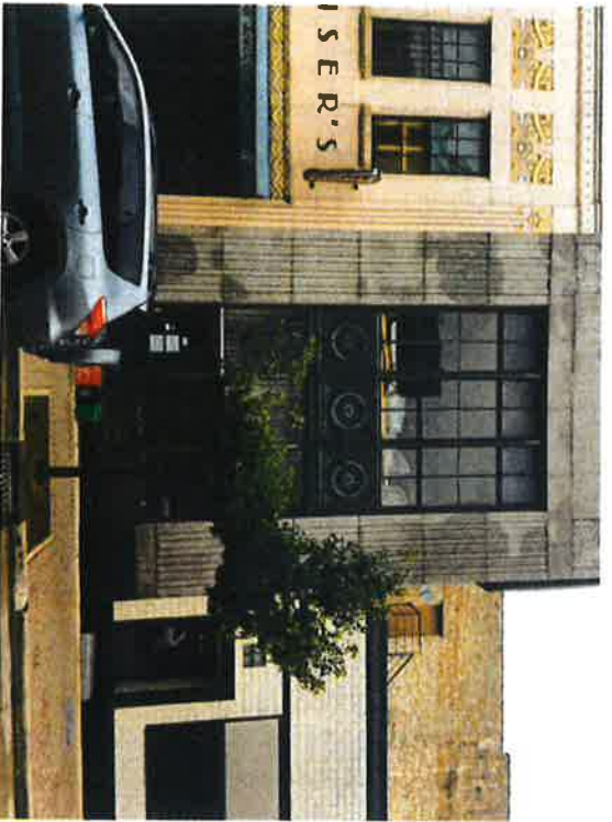
216 6 th St Front Elevation