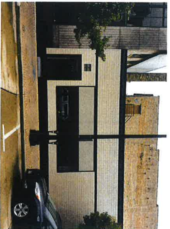
East building of 216 th 6 th St