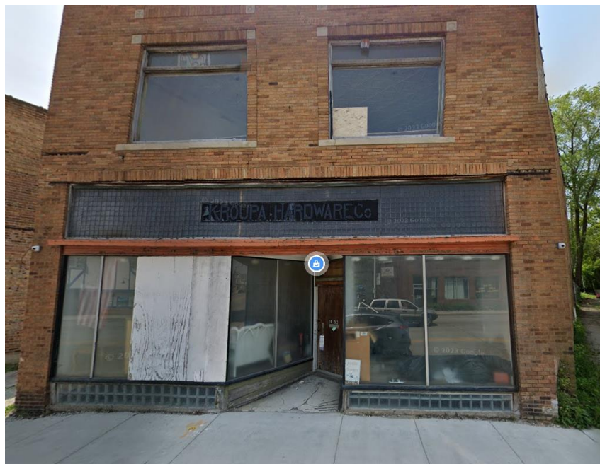
Current façade of 1334 Washington Avenue, picture provided by the applicant.