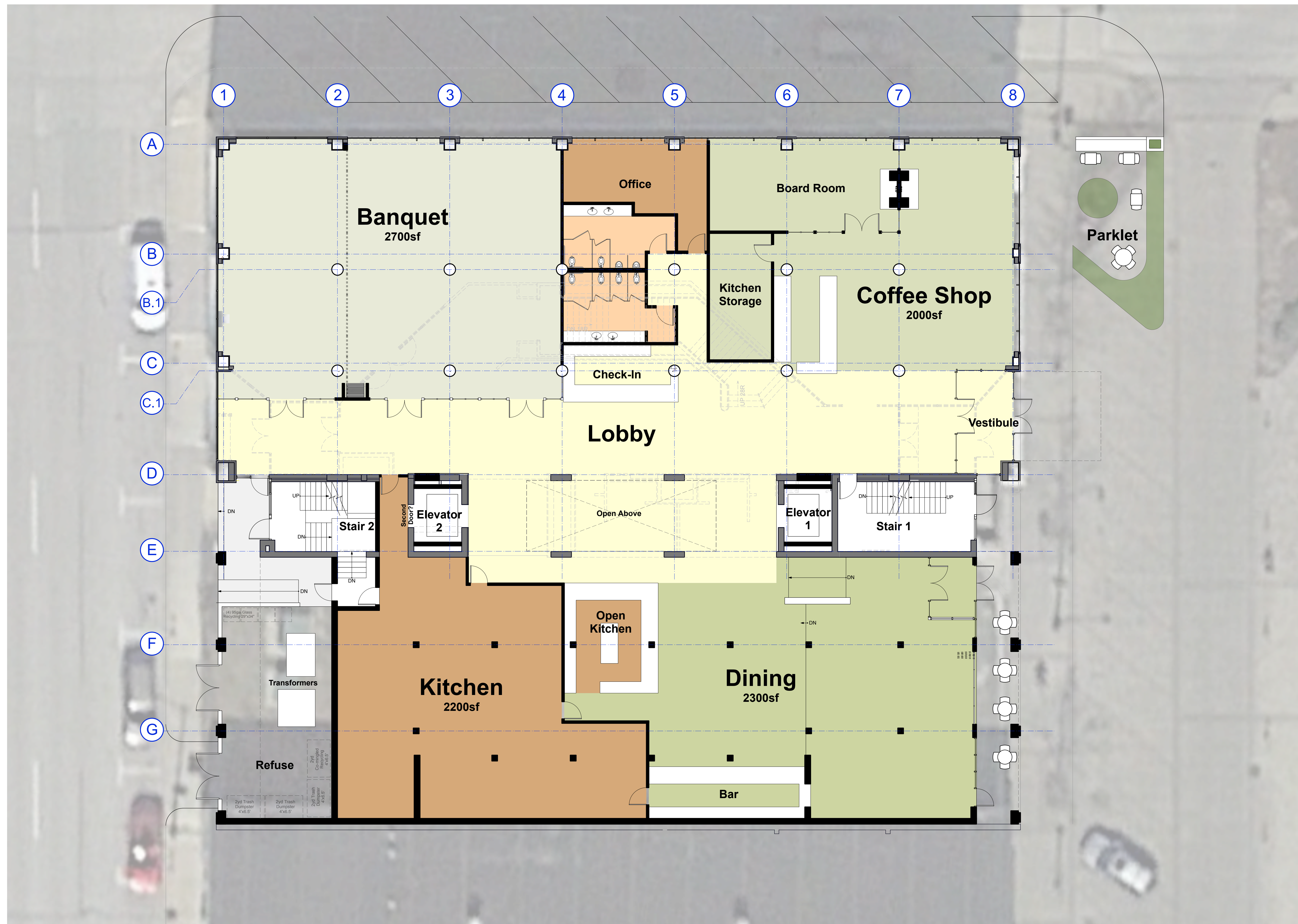
1 FIRST FLOOR PLAN A1.1 SCALE: 1/8" = 1'-0"