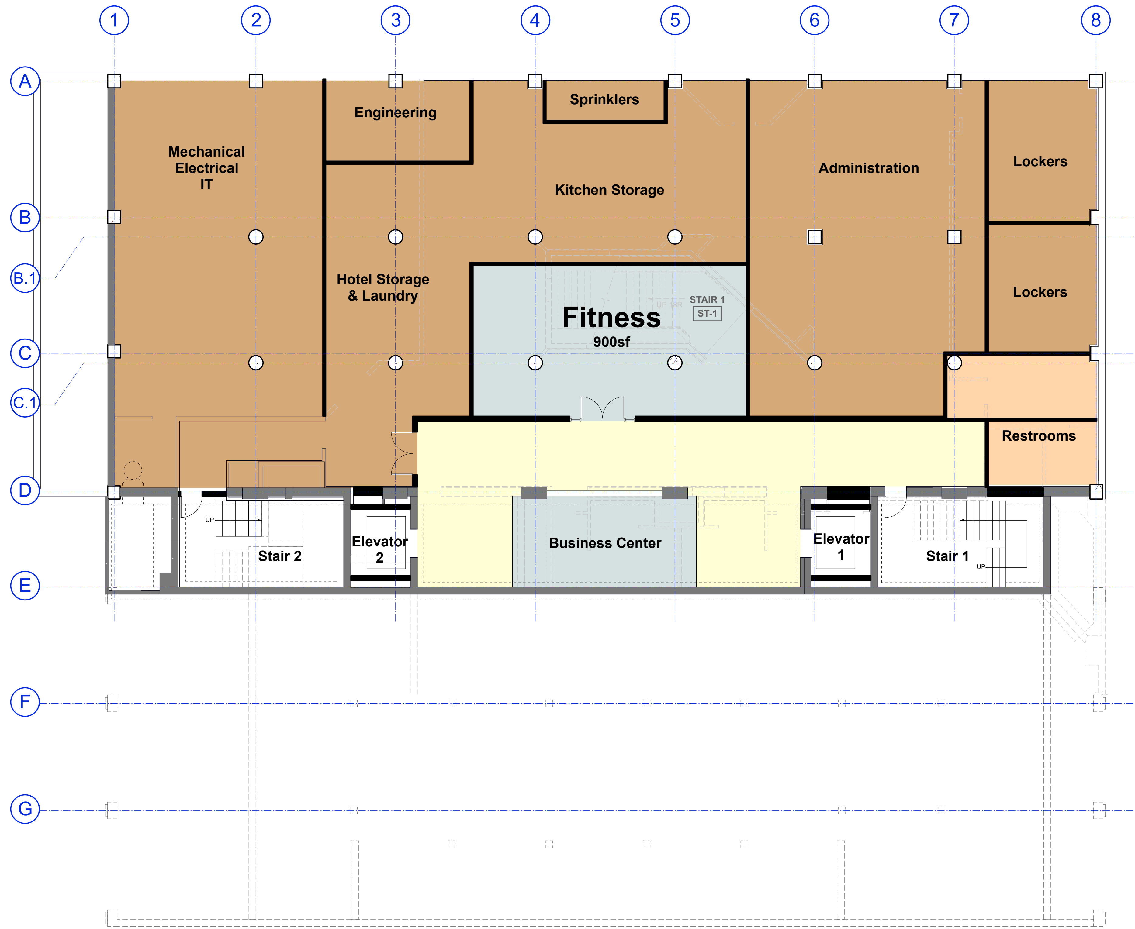
1 LOWER FLOOR PLAN A1.0 SCALE: 1/8" = 1'-0"

Copyright © 2018 The Kubala Washatko Architects, Inc.