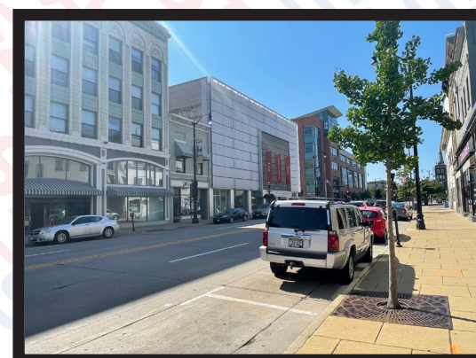
422 Main Street - Southeast