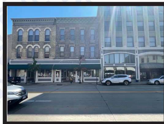
422 Main Street - East