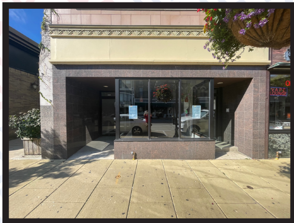
422 Main Street - Current View

THIS DRAWING IS THE PROPERTY OF FASTSIGNS OF RACINE. THE BORROWER AGREES THAT IT SHALL NOT BE REPRODUCED, COPIED OR DUPLICATED IN ANY WAY WITHOUT EXPRESS WRITTEN PERMISSION.