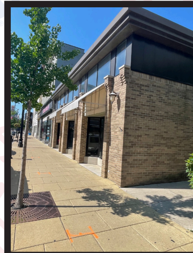
422 Main Street - South