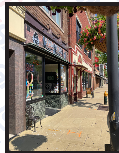
422 Main Street - North