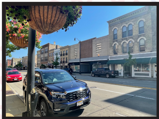
422 Main Street - Northeast