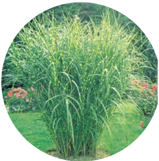
Zebra Grass ●