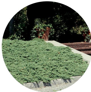
Juniper Ground Cover ●