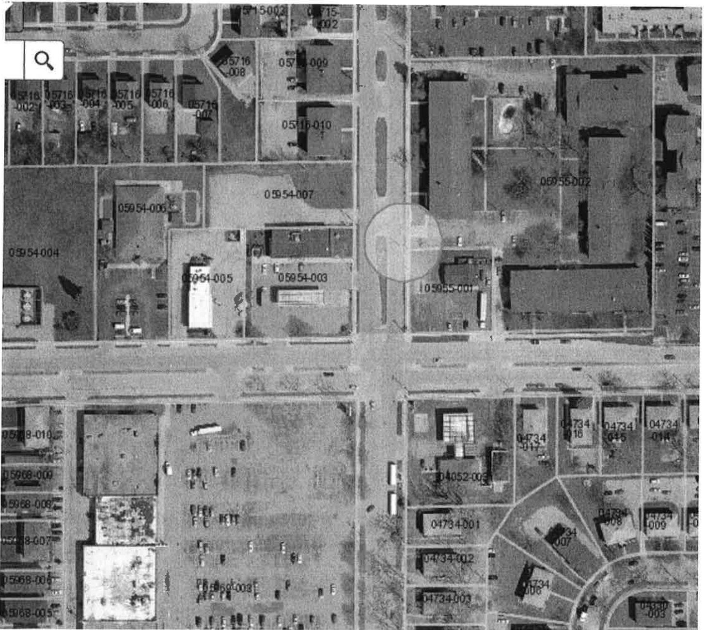
Below: Erie runs North/South