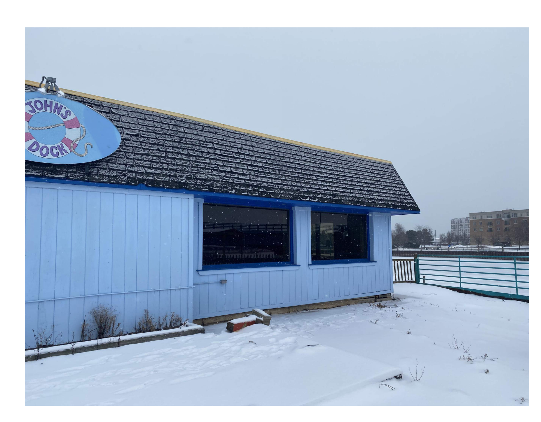
EXISTING BUILDING SIDE (WEST) FACE