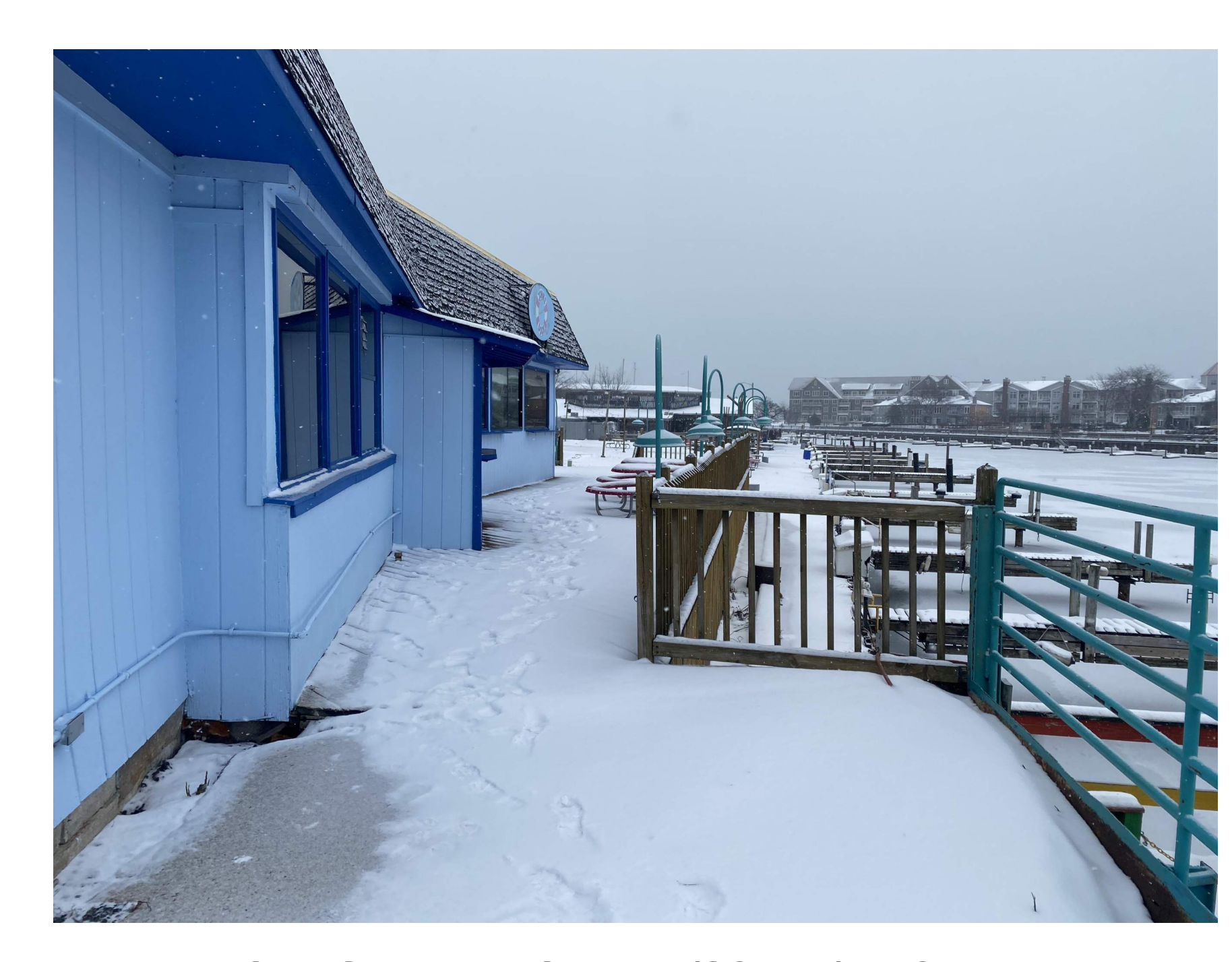
EXISTING BUILDING REAR (SOUTH) FACE