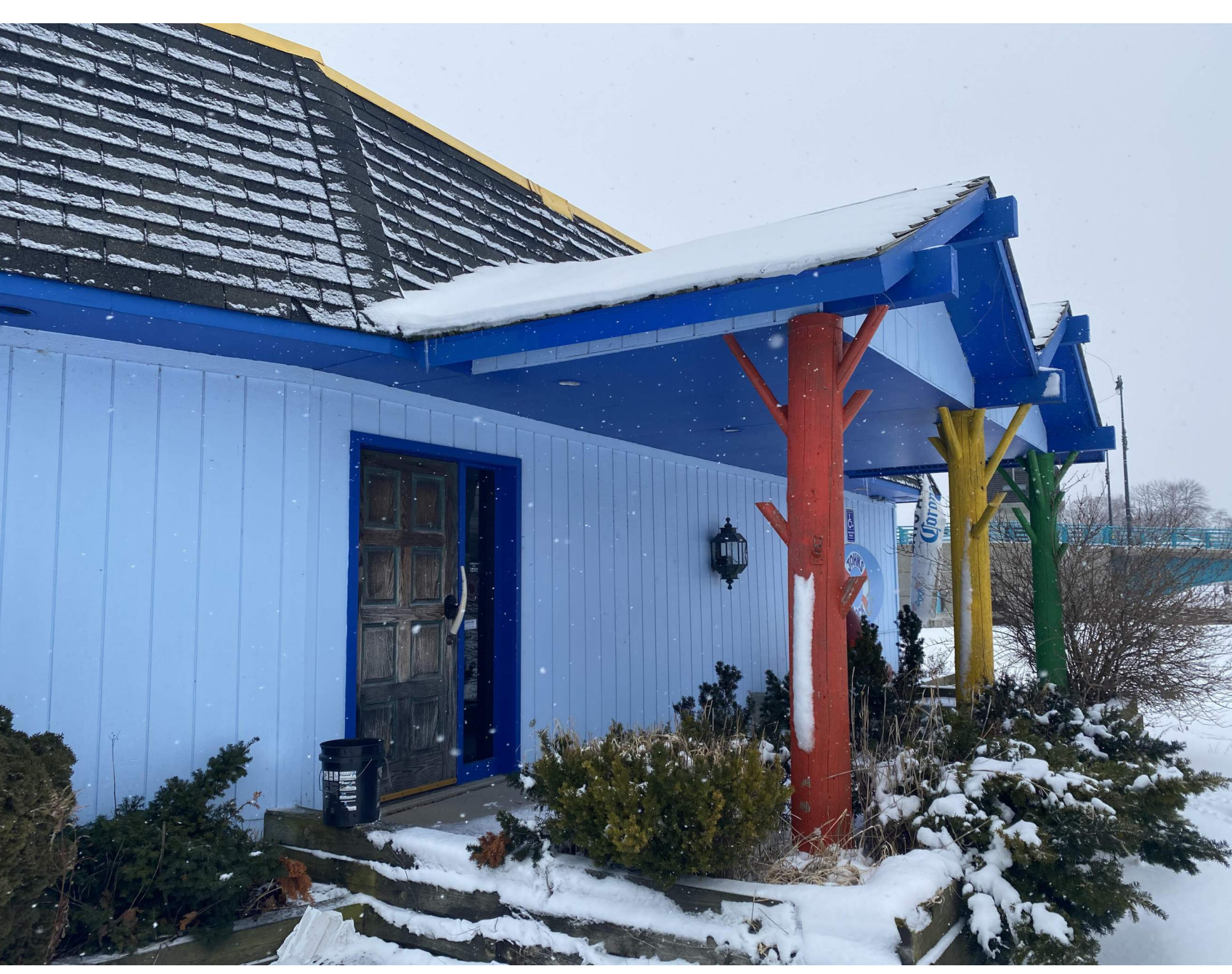
EXISTING BUILDING FRONT (NORTH) ENTRANCE