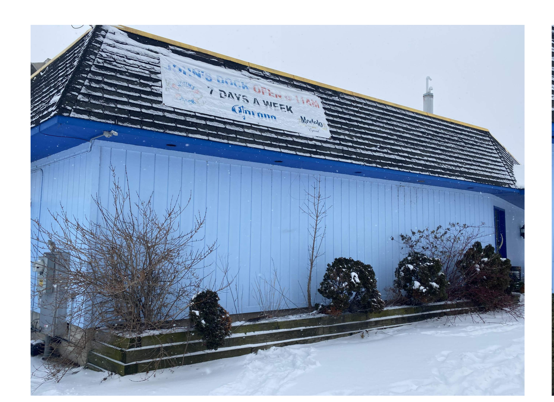
EXISTING BUILDING FRONT (NORTH) FACE