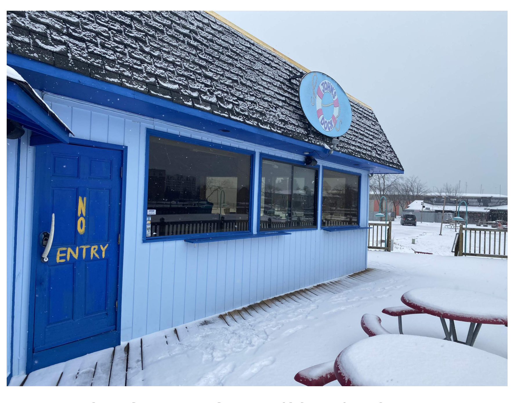
EXISTING BUILDING REAR (SOUTH) FACE