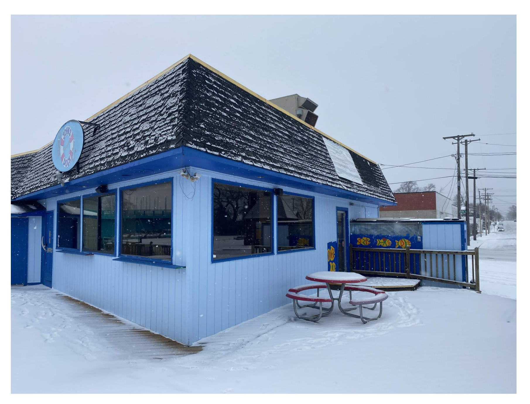
EXISTING BUILDING SE CORNER