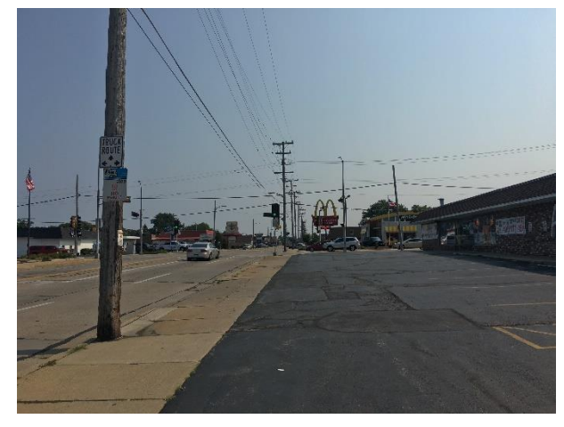
Looking south from subject property