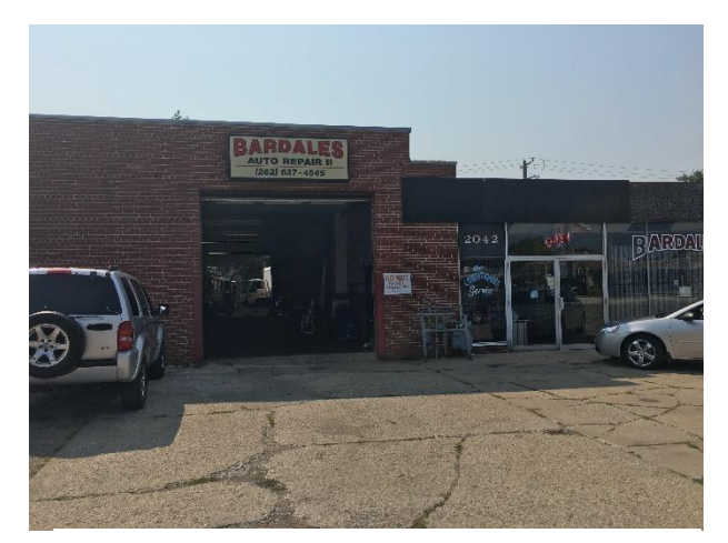
Looking at office area of proposed use