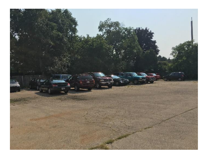
Looking at parking area at rear of subject property