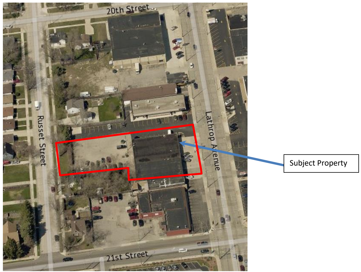
Birdseye view of the property, indicated in red (image from City Pictometry).