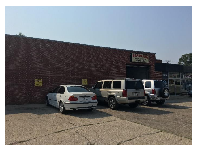
Looking west at subject property