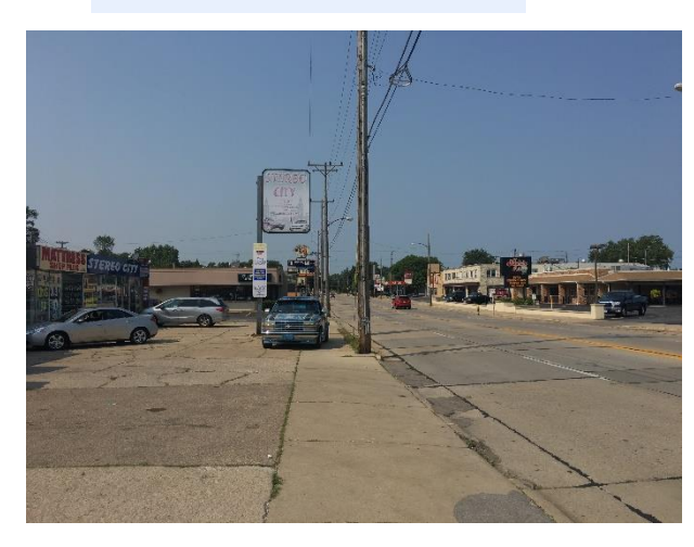
Looking north from subject property