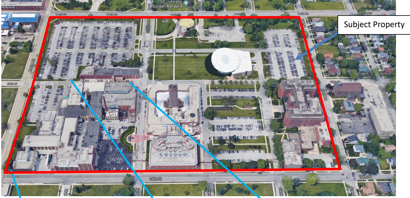
Birdseye view of the property, indicated in red.