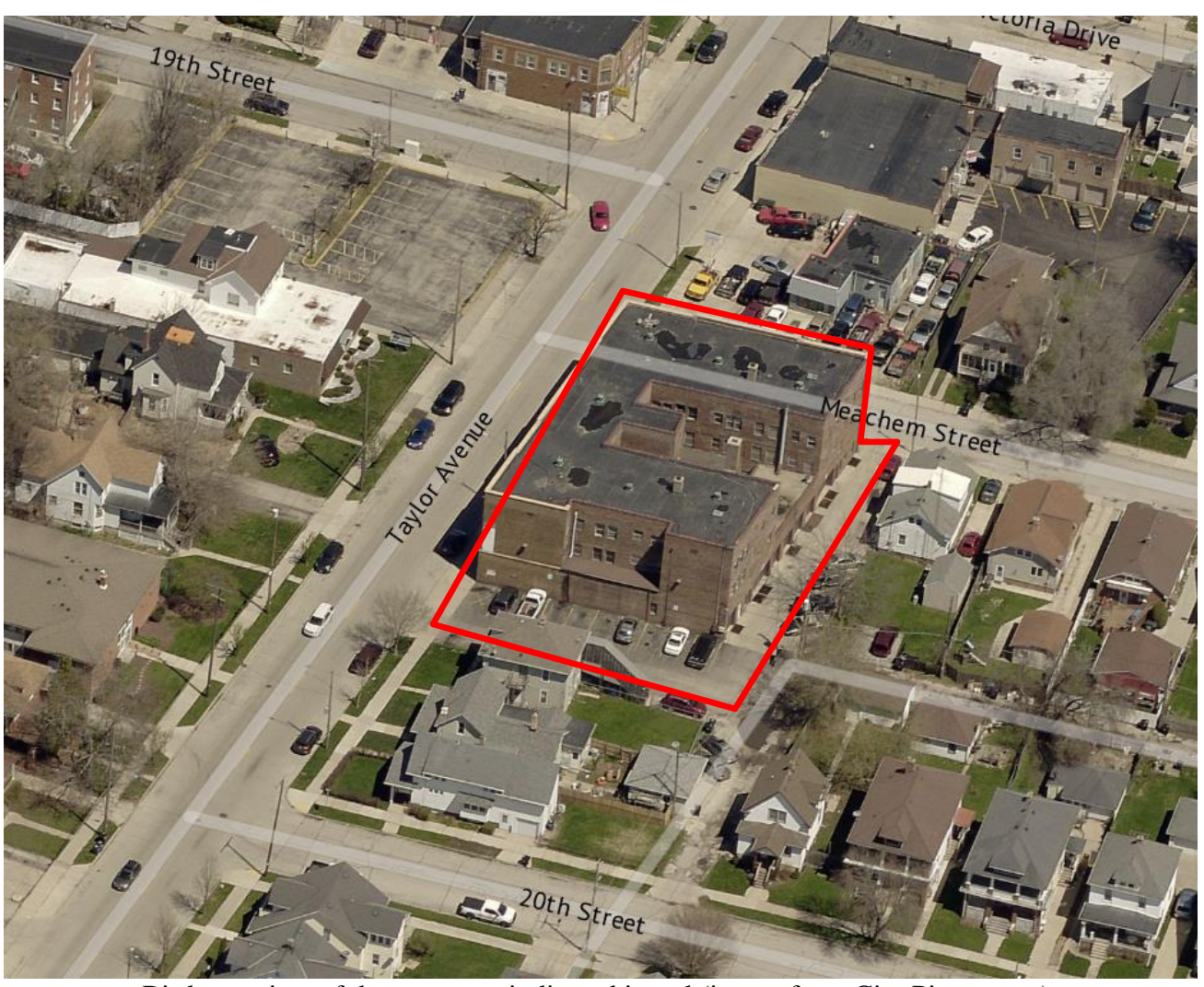
Birdseye view of the property, indicated in red.