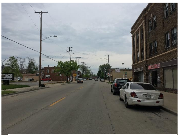
Looking north along Taylor Avenue