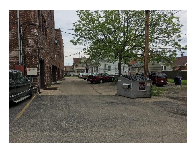
Looking north from parking area and rear access drive