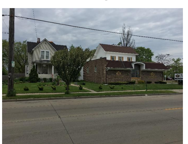
Looking west from subject property