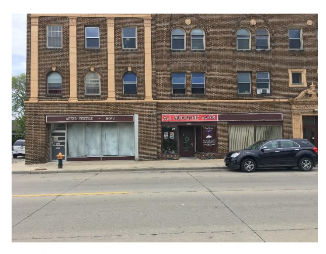
Looking east at the subject property, tenant space centered in the photo