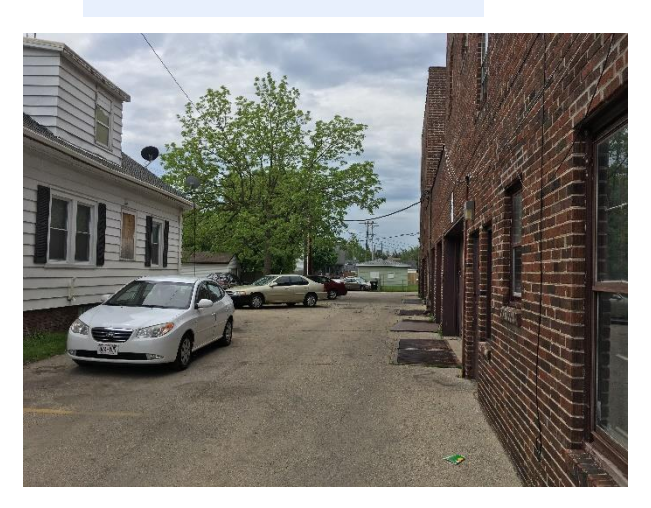
Looking south from rear of building along northern property line