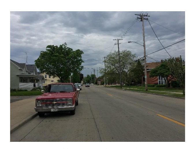
Looking South along Taylor Avenue