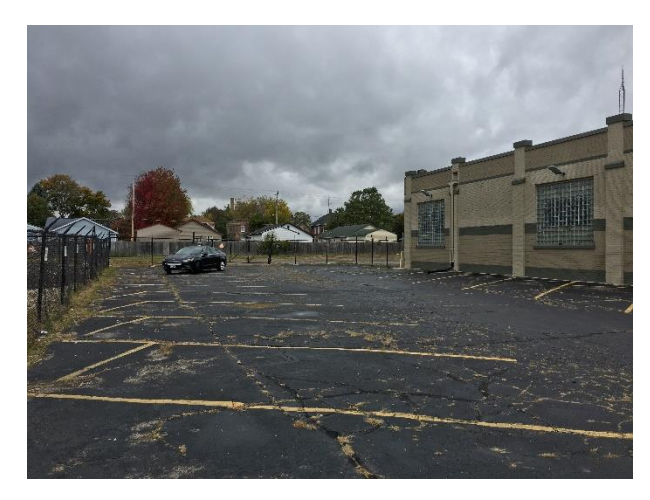
Looking west from Memorial Drive at parking area