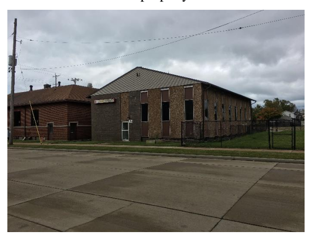
Looking south at 1950's era building used recently as a daycare