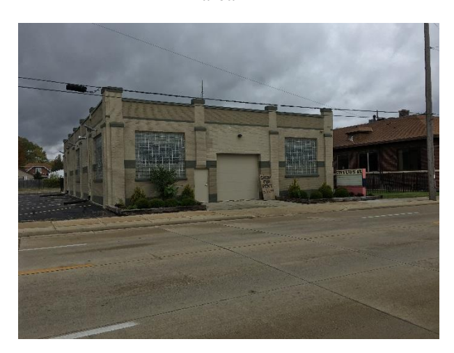
Looking west at southernmost building on property