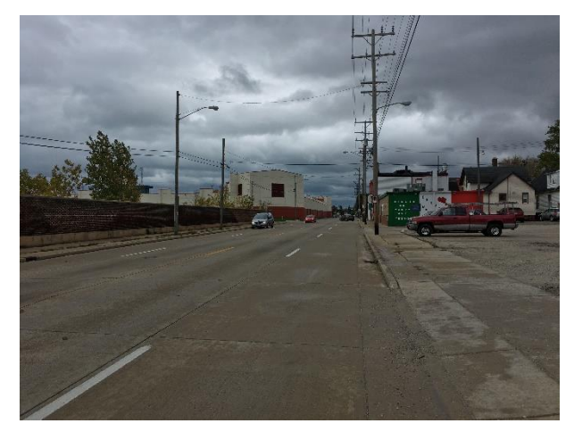
Looking south on Memorial Drive from subject property