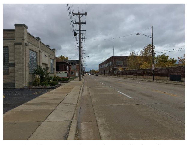
Looking north along Memorial Drive from subject property