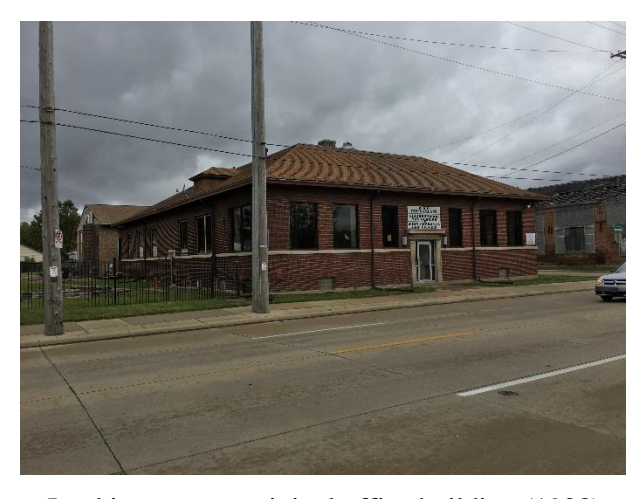
Looking west at original office building (1923) on property