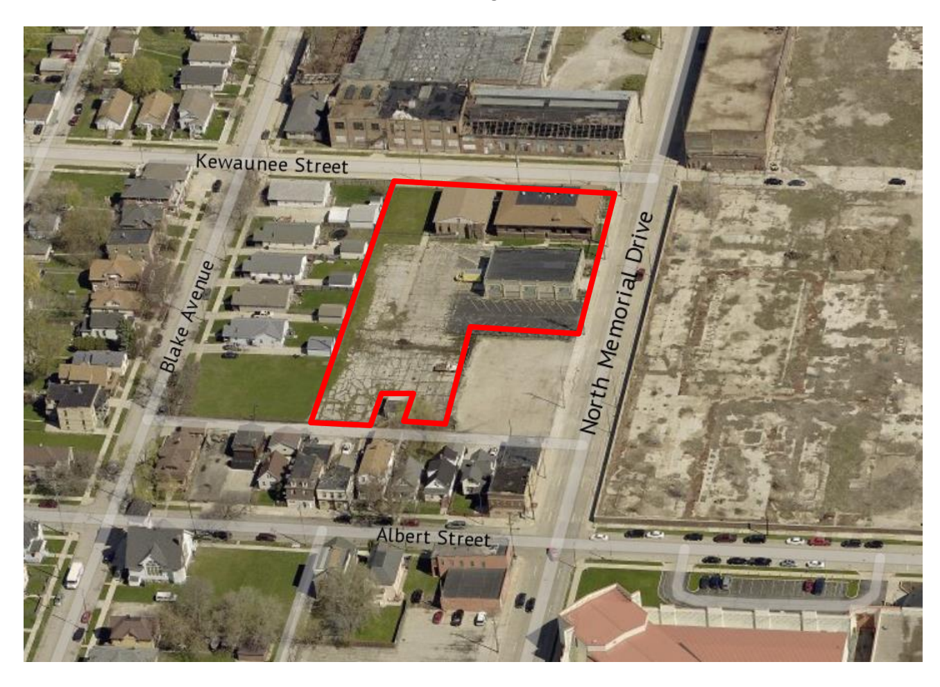
Birdseye view of the property, indicated in red.