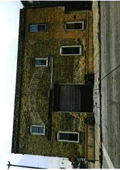
Front of building