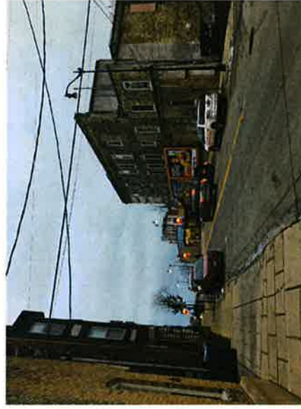
Looking east from Littleport Brewery