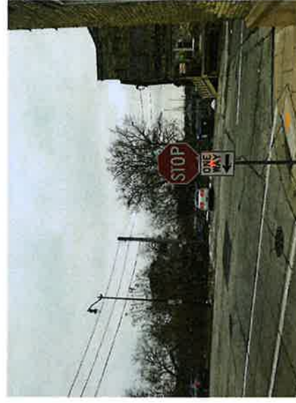
Looking west from Littleport Brewery