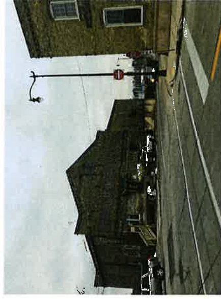
Building to the west