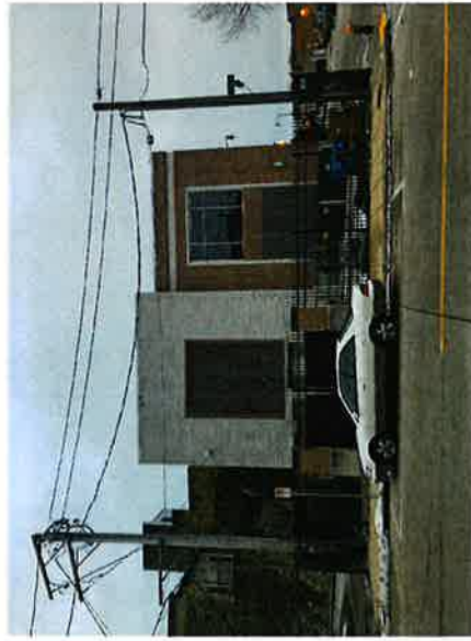
Across the street, looking south