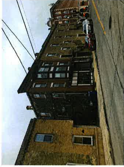
Building to the east