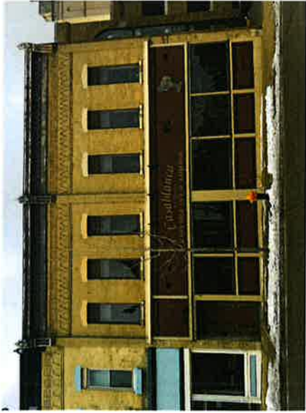
Front of building