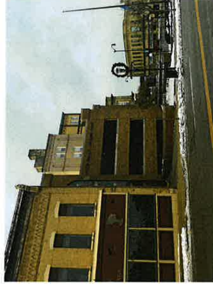
Property to the north