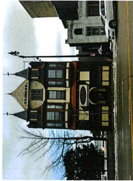
Across the street, looking east