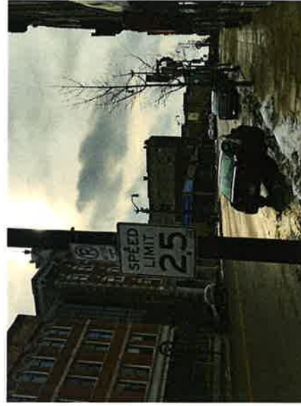
Looking south from Amos Los Tacos