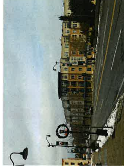
Looking north from Amos Los Tacos