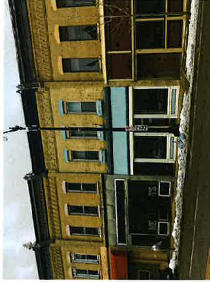
Building to the south