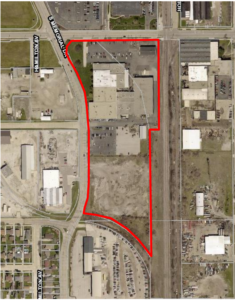
Birdseye view of the property, indicated in red.