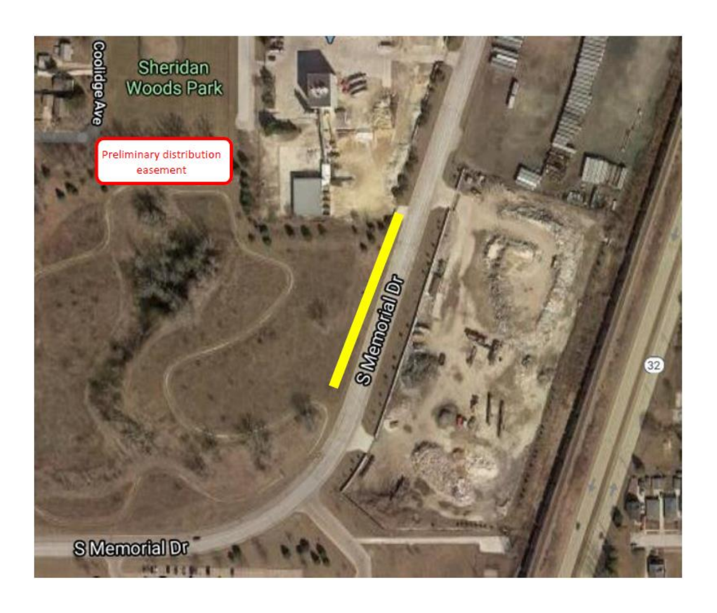
EXHIBIT E Preliminary Map of Distribution Easement