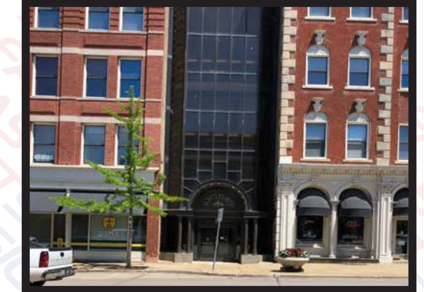
240 Main St. (Looking East)