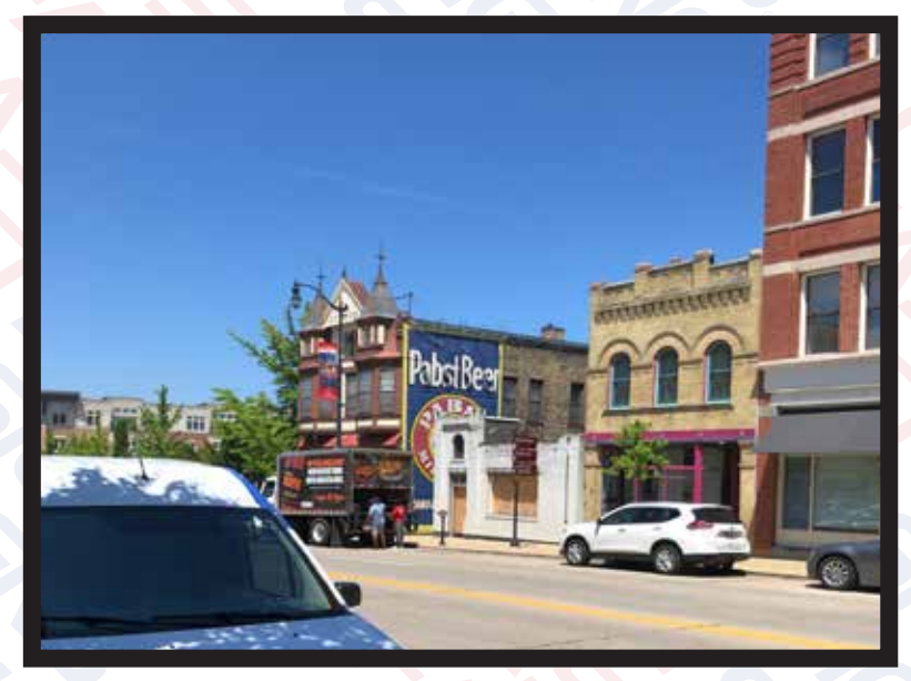
240 Main St. (Looking Northeast)