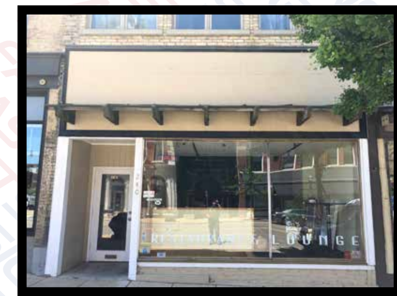
240 Main St. Current View