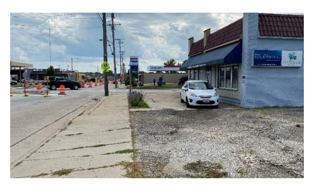
Looking south at area where signage would be installed