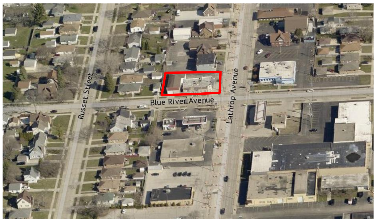
Birdseye view of the property, indicated in red, (north is up) (image from City Pictometry)