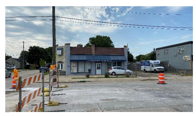
Looking west at subject property from Lathrop Avenue