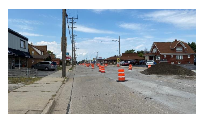
Looking north from subject property