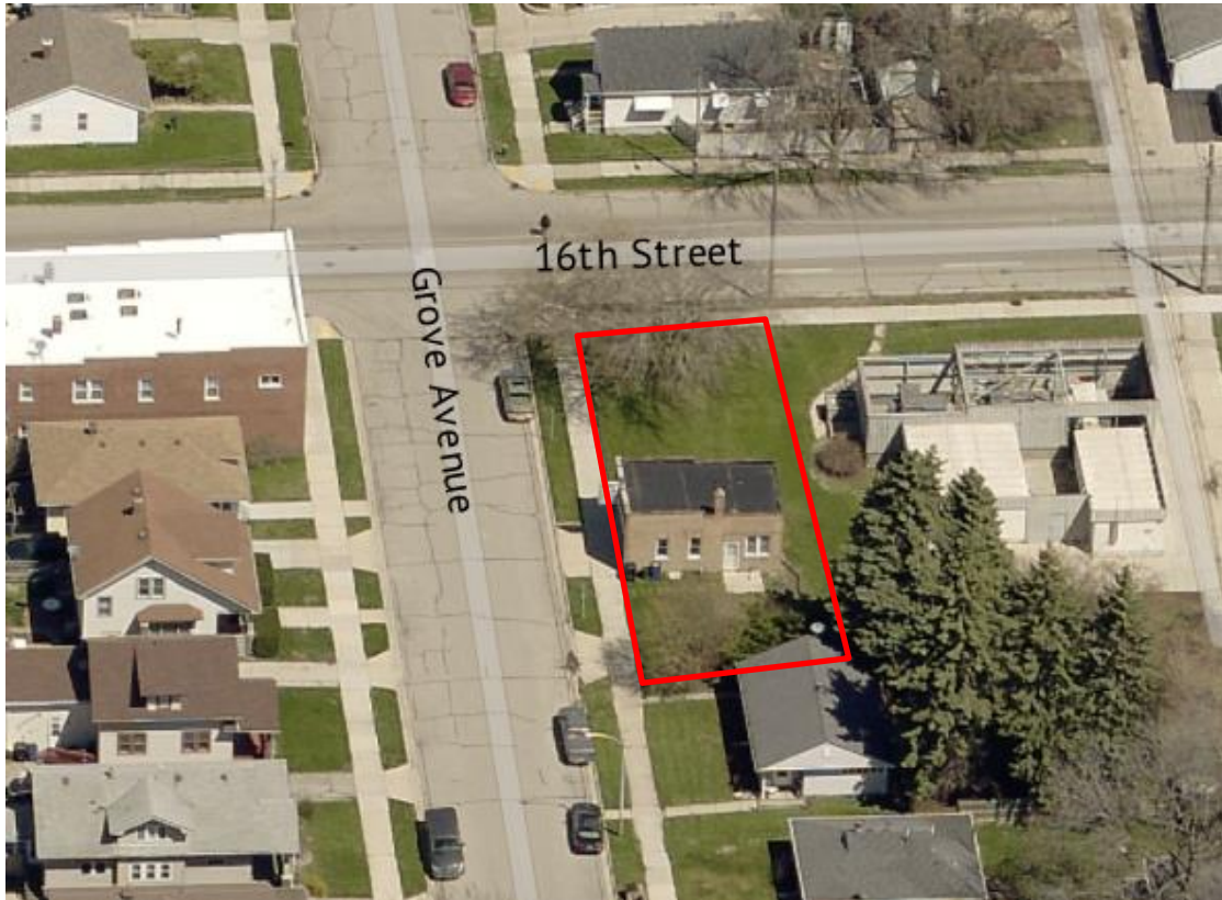
Birdseye view of the property, indicated in red.