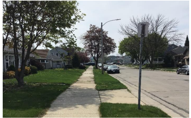
Looking south from subject property