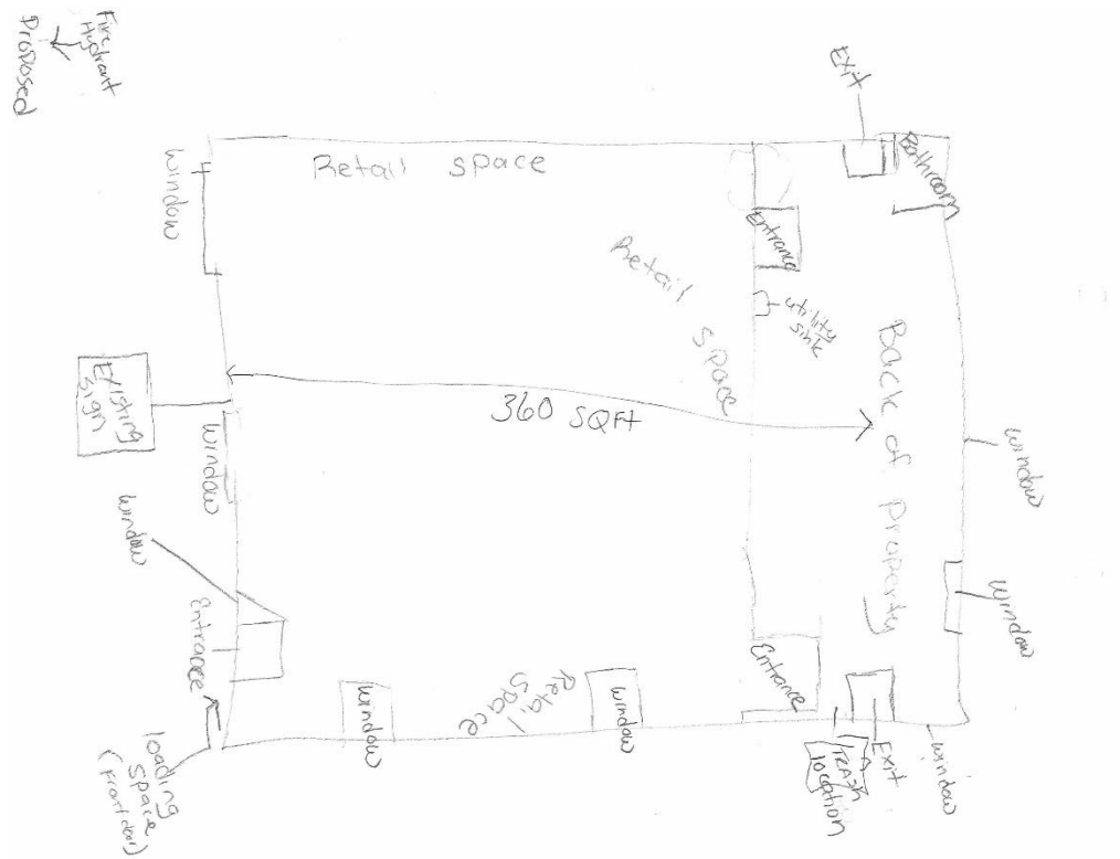
Proposed Building Floor Plan for 1615 Grove tenant space (north is up), submitted by applicant.