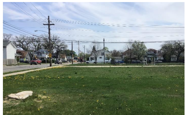
Looking east from subject property