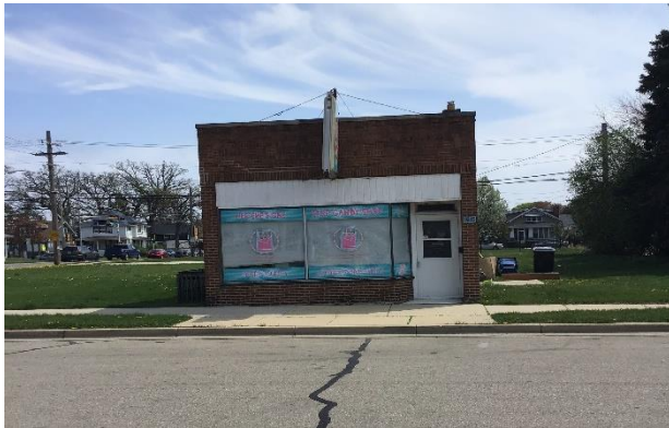
Looking east at property from Grove Avenue