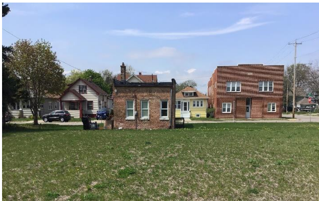
Looking west at rear of subject property