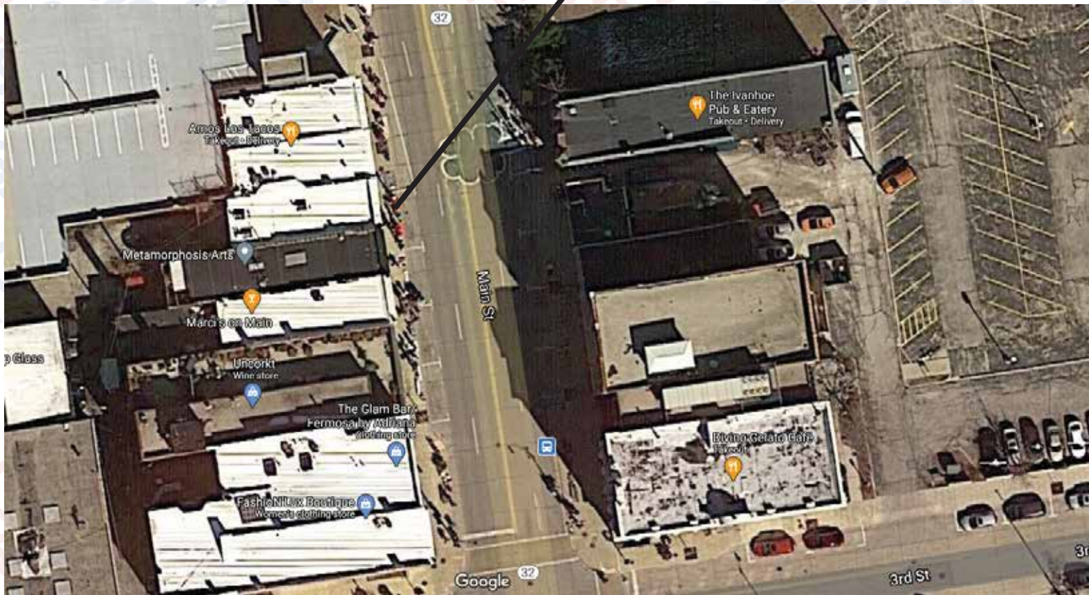
232 Main Street - Overview