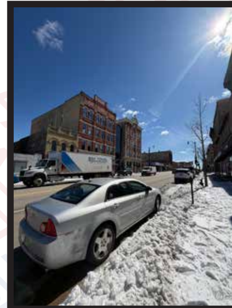
232 Main Street - Southeast