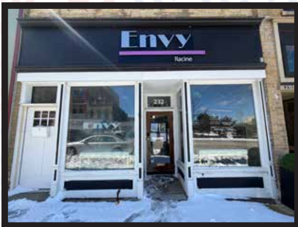
232 Main Street - Current View