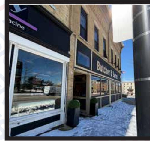
232 Main Street - North