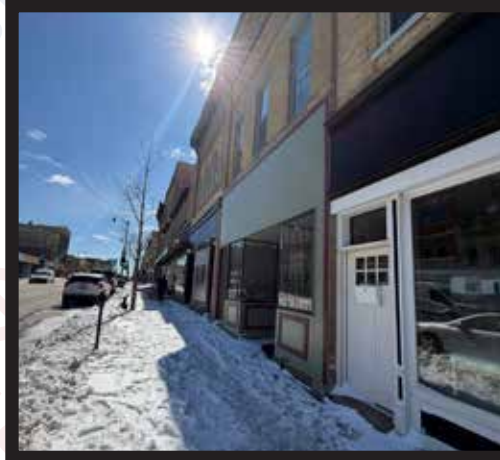
232 Main Street - South