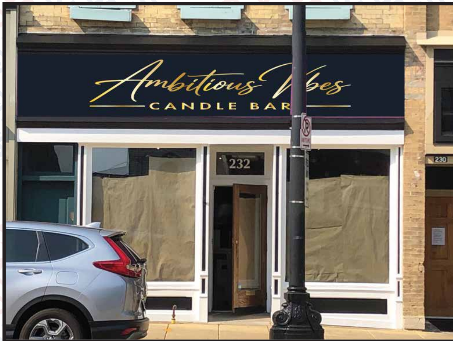
232 Main Street

THIS DRAWING IS THE PROPERTY OF FASTSIGNS OF RACINE. THE BORROWER AGREES THAT IT SHALL NOT BE REPRODUCED, COPIED OR DUPLICATED IN ANY WAY WITHOUT EXPRESS WRITTEN PERMISSION.